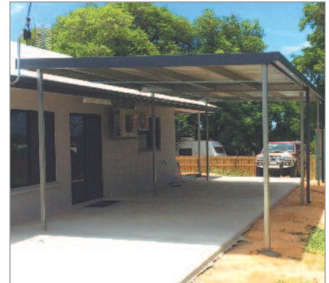
Carports & Awnings