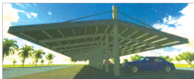
Example of an SFS Sheds 3D rendering

Our sheds come with a full sheeting layout and all parts are clearly and simply labeled. It will tell you where to start, right through to where to finish.