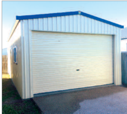
Sheds & Garages