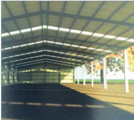
Horse Riding Arenas