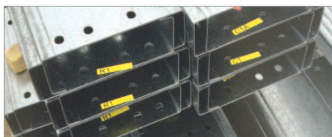
SFS Sheds labelling